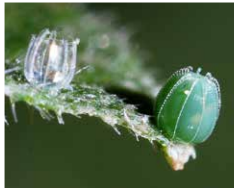
Close-up of comma butterfly eggs on common nettle

Around 60 species of butterfly are seen regularly in the UK, comprising less than 3% of British Lepidoptera (butterflies and moths). The remaining 2,500 or so species are moths but, as most of them fly at night, they are far less well known. Farmland is the main habitat for over three quarters of British butterflies. Many butterflies and moths, both common and rare, have suffered population declines, but a range of measures can help encourage them and increase their numbers on farmland.