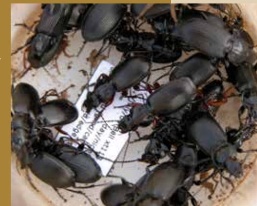
Carabid beetles (left) and spiders were monitored on organic and non-organic farms © James Bell