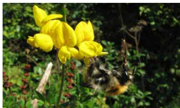
The carder bee is one of Britain's 24 species of bumblebee