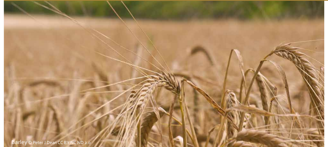
Barley