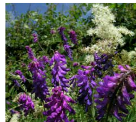
Valuable nectar sources such as tufted vetch are found at hedge bases and on field corners

Nectar and pollen also need to be available to bumblebees and other pollinators throughout the flight season from March through until September. By encouraging a range of suitable wildflowers it is more likely that this continuity will be achieved. A diversity of plants will also benefit other pollinators, such as butterflies and moths, which need larval foodplants as well as nectar sources for the adults.