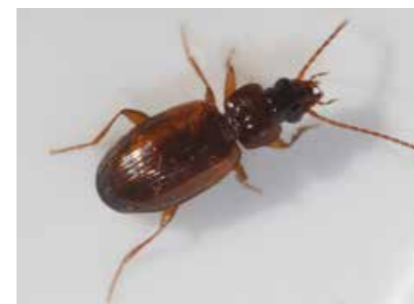
Ground beetles will overwinter in tussocky grass strips or beetle banks