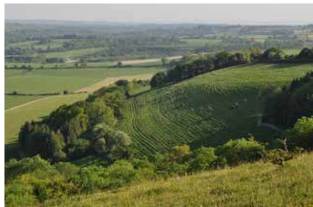
Unimproved calcareous grasslands should be managed to create mosaics of grassland and scrub