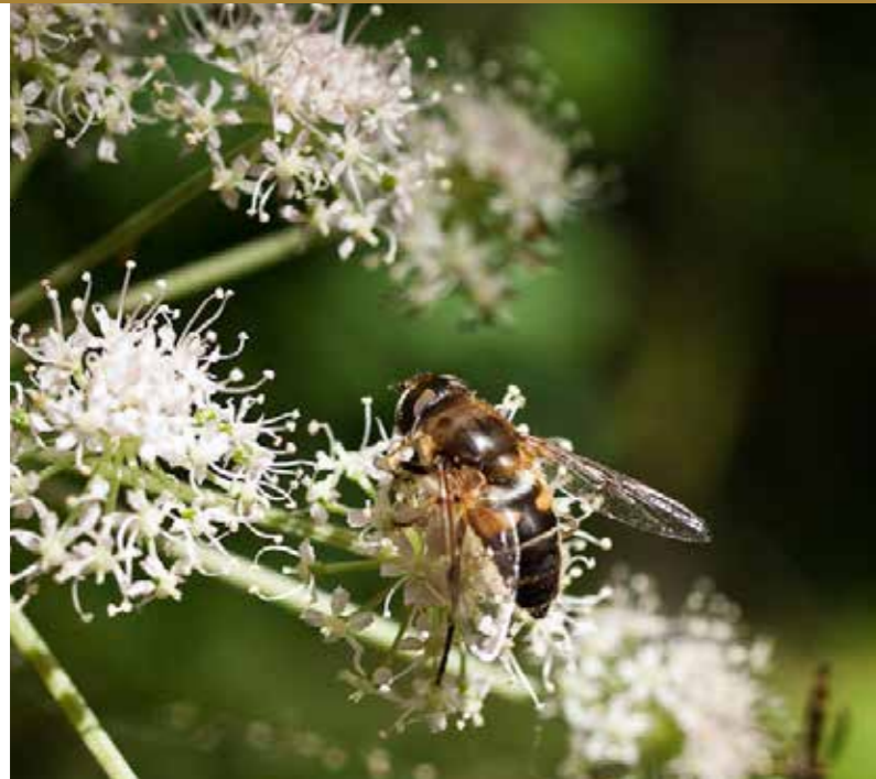
Hoverflies are important pollinators