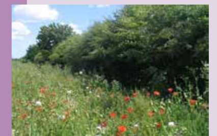
Hedgerows are important for butterflies