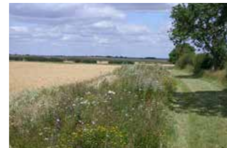
Field margins will enhance predatory invertebrate populations. Adding wildflowers to a mixture will increase its value