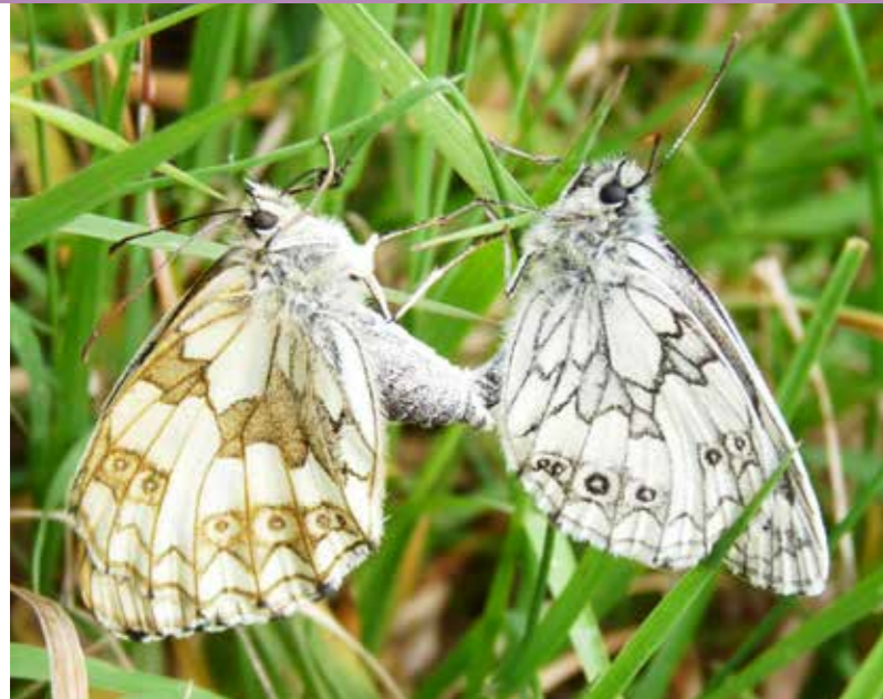
Moths and butterflies, such as these marbled whites, require suitable breeding habitat as well as nectar sources

Around 60 species of butterfly are seen regularly in the UK, comprising less than 3% of British Lepidoptera (butterflies and moths). The remaining 2,500 or so species are moths but, as most of them fly at night, they are far less well known. Farmland is the main habitat for over three quarters of British butterflies. Many butterflies and moths, both common and rare, have suffered population declines, but a range of measures can help encourage them and increase their numbers on farmland.