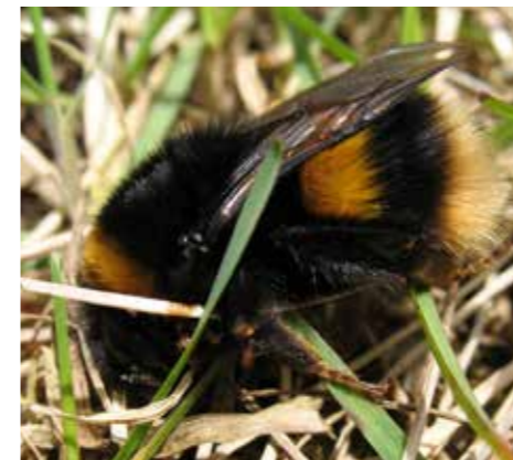
Bumblebees also need underground or tussocky places to nest