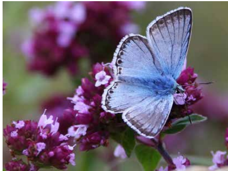
The chalkhill blue butterfly is confined to calcareous grasslands