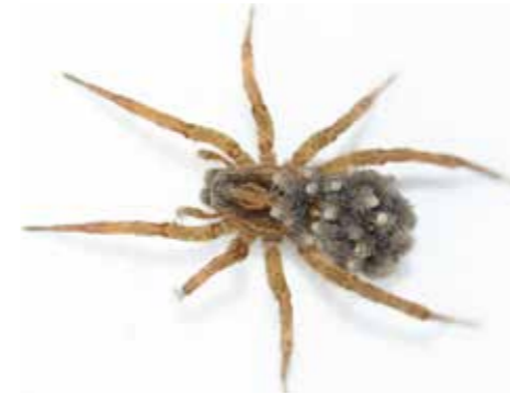
This wolf spider has spiderlings on her back. Spiders benefit from good vegetation structure