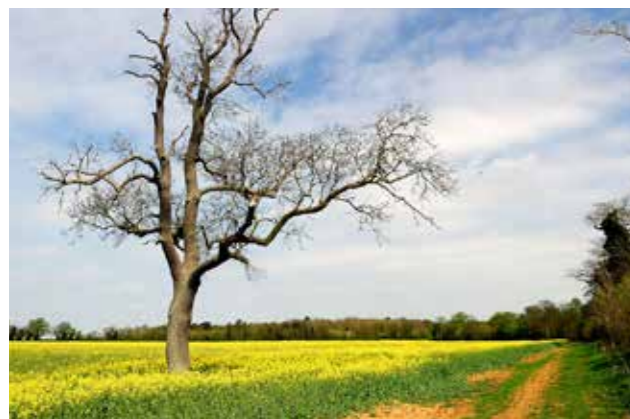
Insect pollination can increase seed set of oilseed rape