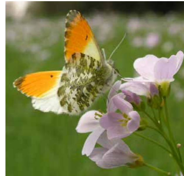
Orange tip butterflies use cuckooflower both as a nectar source and a caterpillar foodplant

Any grassland that contains some native grasses and wild flowers can be important for butterflies and moths. Damp grassland with rushes will support green-veined white and orange tip butterflies, while acid or neutral grassland will be used by ringlets, meadow browns and common blue butterflies. Leaving some areas of grassland uncut during the spring and summer will allow plants to flower and provide undisturbed breeding habitats. Where possible, avoiding or reducing fertiliser and pesticide use will increase plant and butterfly diversity.