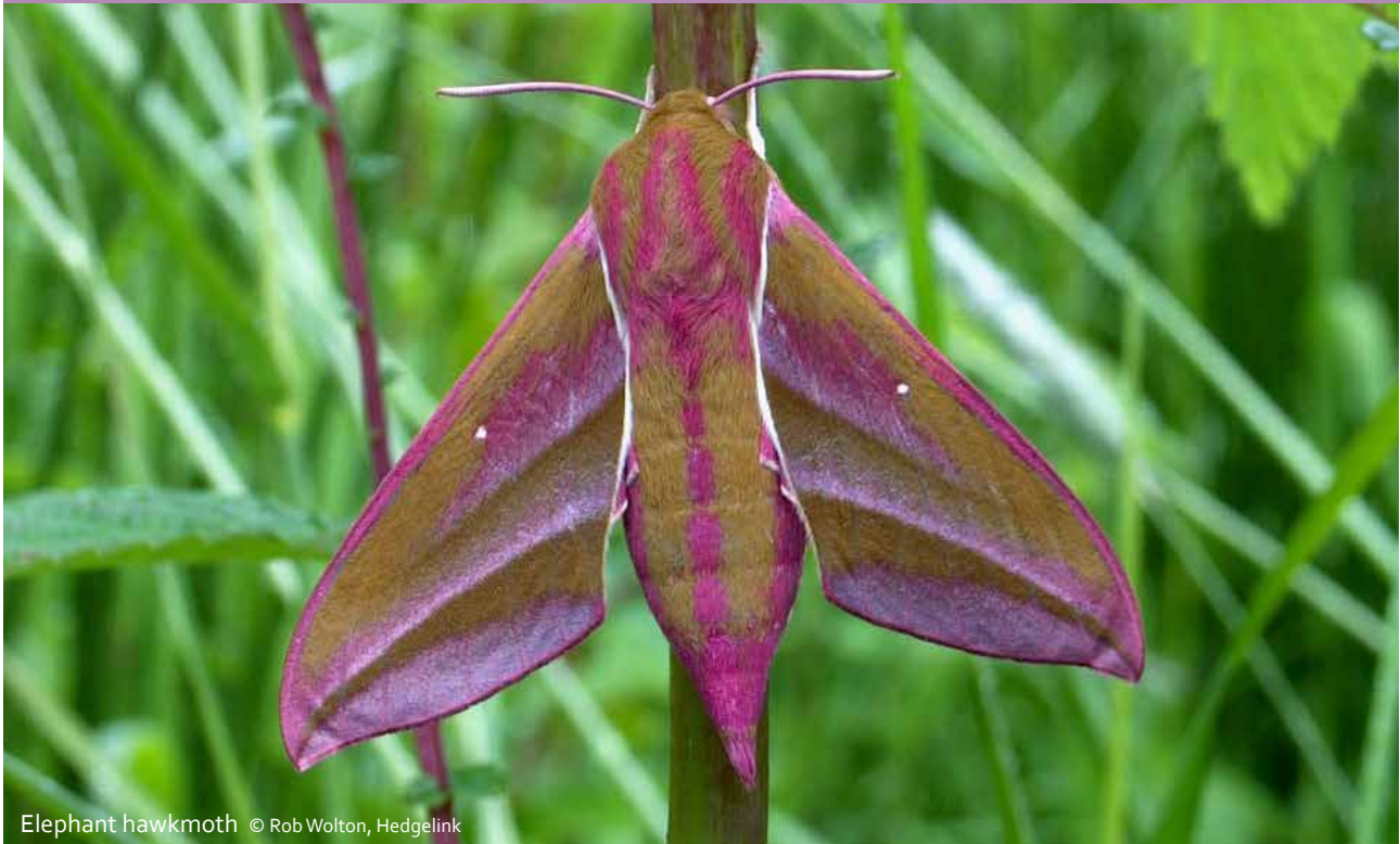
Elephant hawkmoth