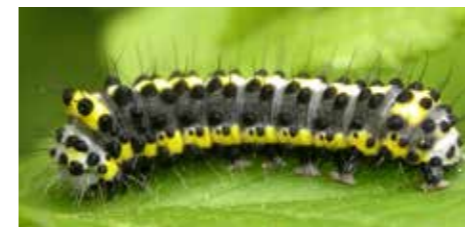
The figure of eight moth may have suffered from intensive hedgerow management