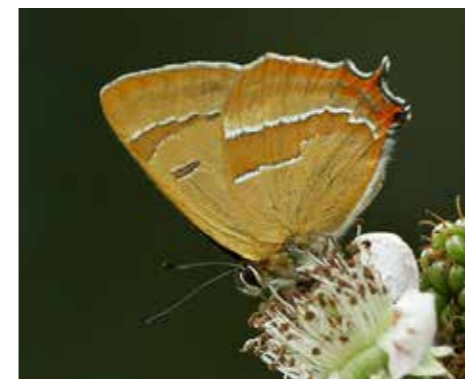
Brown hairstreak overwinters as eggs on blackthorn hedges