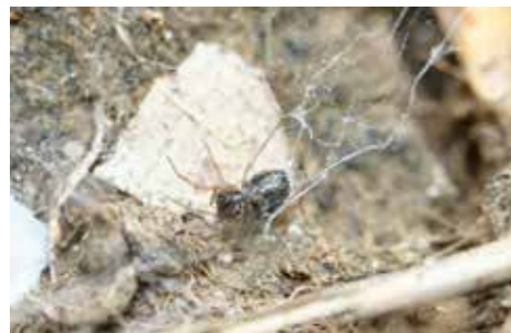
Linyphiid, or 'money' spiders, are tiny spiders that can disperse on air currents high above the landscape