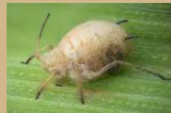
Parasitoid wasp (top) and mummified aphid host (below).