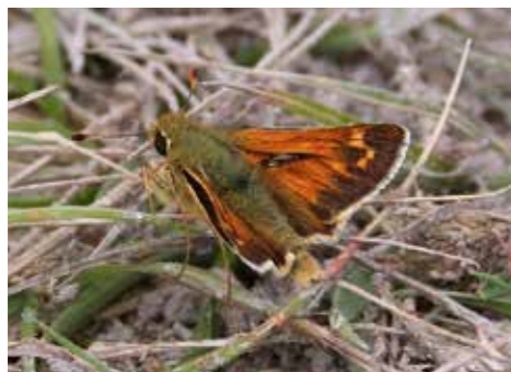
Silver-spotted skippers have precise requirements for egg-laying

Butterflies will take nectar from a range of plants, but plants such as knapweeds, scabious, thistles, marjoram, teasel, fleabane and bird's-foot trefoil are especially favoured. Because different butterfly and moth species are on the wing at different times throughout the spring and summer it is important to have a succession of flowering plants through the season. Early nectar sources include willow and blackthorn blossom, self-heal, primrose and lady's smock, while important late sources of nectar are bramble and ivy. Berries, including blackberries, are also useful. Moths are important pollinators and some plants, such as the campions, have evolved to be pollinated by moths.