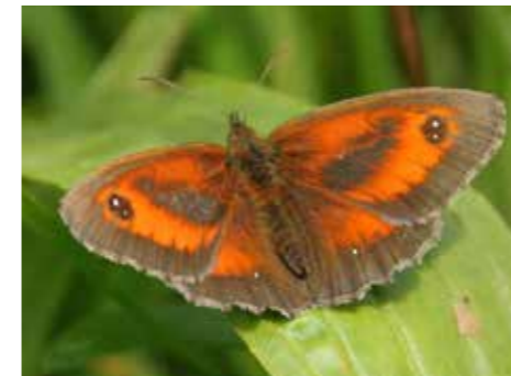
Caterpillars of the gatekeeper butterfly feed on grasses

Breeding requirements vary according to the species. Some moths and butterflies have very precise needs for egg-laying. Female silver-spotted skippers, for example, are extremely fussy, laying single eggs on the leaf blades of sheep's fescue in short turf, up to 4cm, and often next to patches of bare ground. This, and other so-called specialist species, often depend on tailored management to maintain the correct habitat.