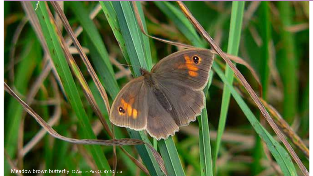
Meadow brown butterfly