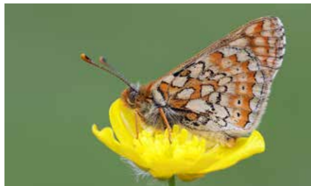
Damp grasslands can support rich communities of plants and butterflies, such as this marsh fritillary