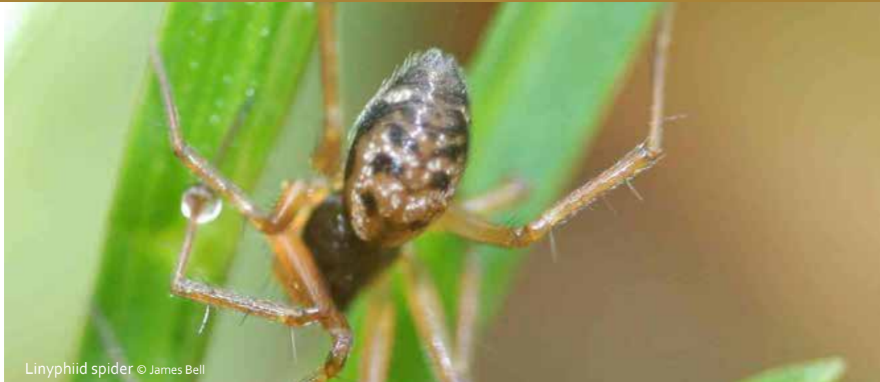
Linyphiid spider © James Bell