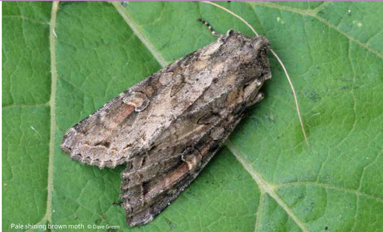
Pale shining brown moth