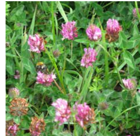
Red clover is a valuable nectar source for bumblebees

Encouraging a diversity of plants is important for pollinators, since different species have different requirements. For example, bumblebee species tend to feed on different flowers, with long-tongued and short-tongued bumblebees generally feeding on deep or shallow flowers respectively. Clovers, vetches and trefoils are particularly important.