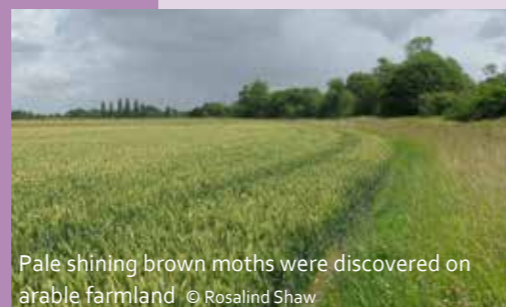
Pale shining brown moths were discovered on arable farmland

It is perhaps surprising that such a large population had been overlooked, but arable farmland may often be under-recorded. The landscape in which the moths were found also suggests that agri-environment scheme options such as field margins may benefit rare and localised species as well as more widespread ones.