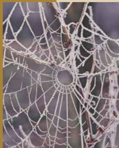
Vegetation with plenty of structure encourages web-building spiders