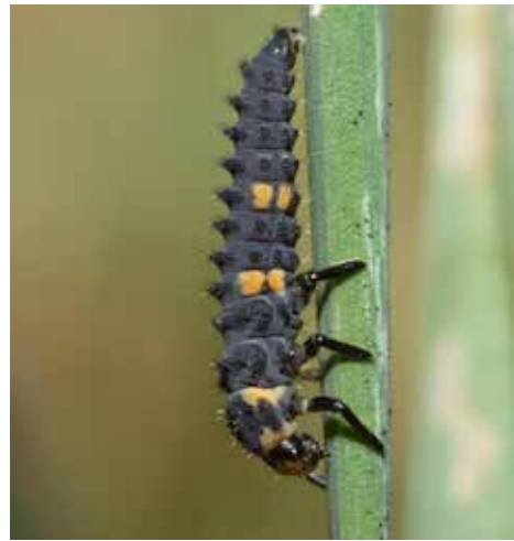
Ladybird larvae feed on aphids in the crop