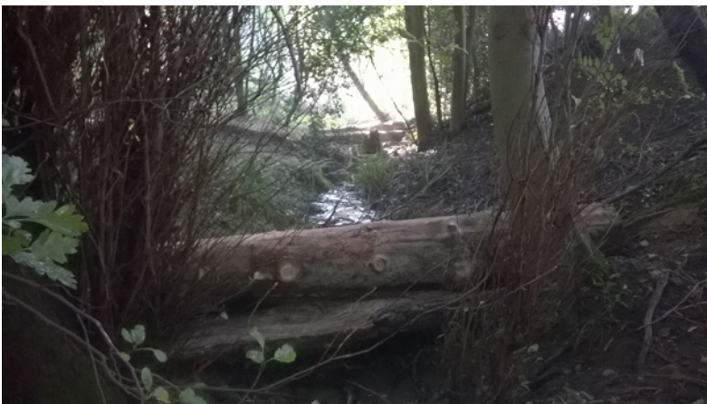
Photo: Large woody debris structure on Wick Street Farm

Like other parts of Gloucestershire, the Stroud Valleys suffered extensive flooding during the summer of 2007. Every year since has seen flooding in some parts of the Stroud Valleys, including most recently Chalford on the middle Frome, and Bridgend and Eastington on the lower Frome.