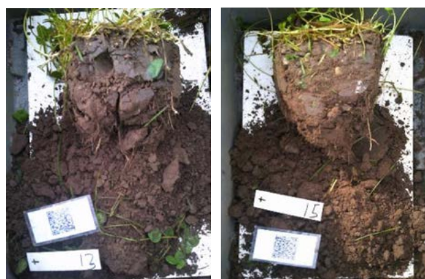
Figure 2. VESS assessment of the long-term FYM (left) and control (right) treatments

The results show the value of applying organic materials for increasing soil organic matter (SOM) contents on light textured soils, particularly bulky materials such as FYM and green compost. These materials also provide valuable nutrients such as P and K, although in the case of P, the soils at Harper are inherently high in extractable P. The VESS scores indicated ‘good’ soil structure throughout the top 30 cm of soil, with an ‘active’ population of earthworms. Additional measures of topsoil bulk density (at 5–10 cm depth) also indicated that the application of bulky organic materials reduced the level of topsoil compaction (from 1.4 g/cm 3 on the control treatment to 1.3 g/cm 3 where FYM or green compost had been applied).