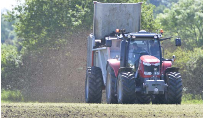
Figure 1. Muck spreader

Testing the effect of organic material additions on soil health